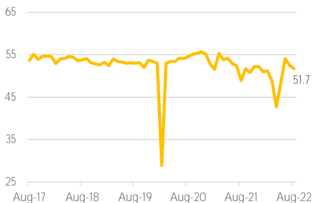
Figure 2: China's composite PMI further eased to 51.7 in August from 52.5 in July