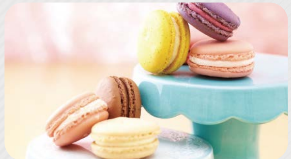
Bakerzin Award-Winning Macarons

Collection at United Square, Raffles Hospital and Maju Avenue outlets only.