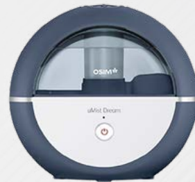
OSIM uMist Dream Air Humidifier