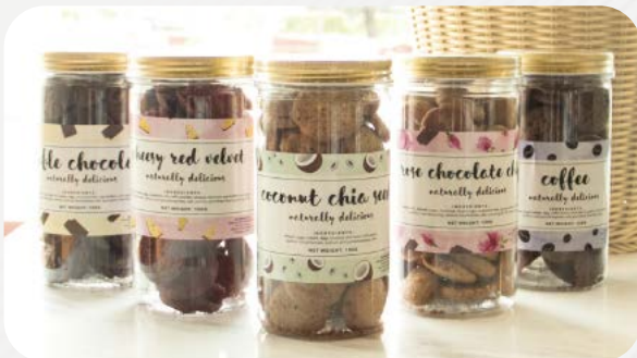
Bakerzin Artisan Cookies