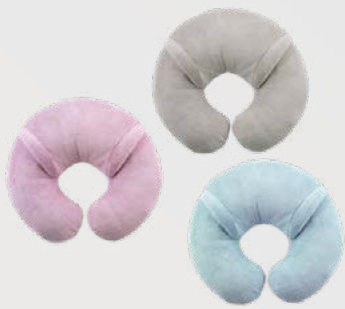
OSIM uSnnooz Neck Pillow